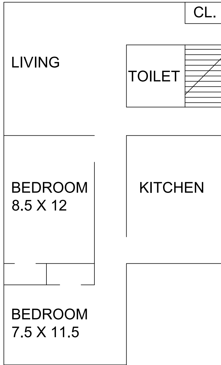
1ST LEVEL 1111 FOREST AVE